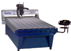
GERBER Sabre Routers