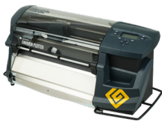
GERBER enVision 375 and 750 Plotters