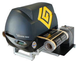
GERBER EDGE Printers