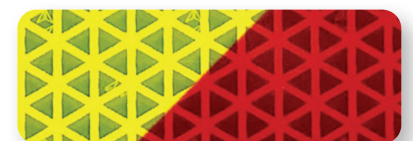
775 Fluorescent Yellow Green & 776 Red Pre-stripe

Ideal for utility vehicles that require increased visibility such as telecom, DOT, fire, EMS, and police vehicles