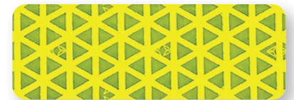
112 Fluorescent Yellow Green